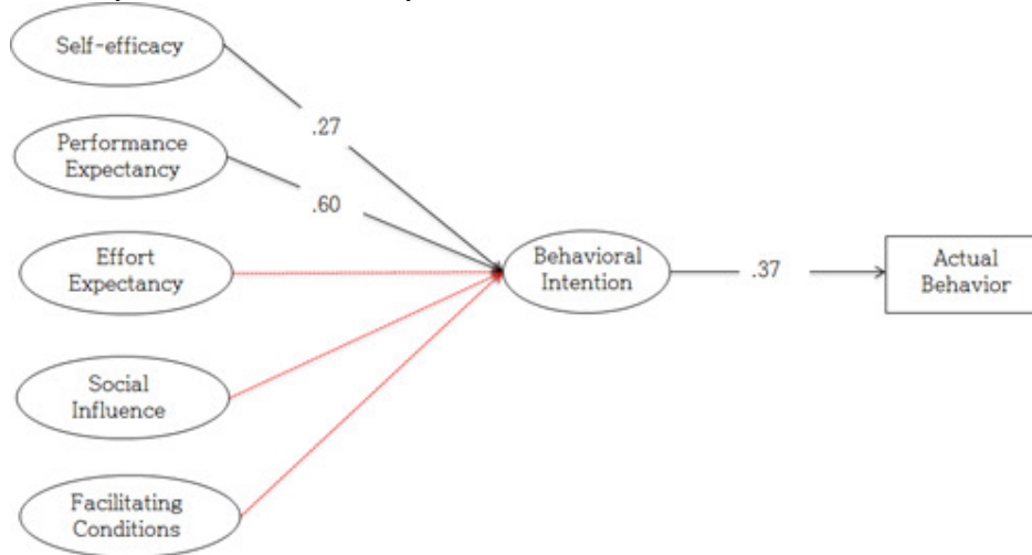
Figure 2. Standardized Path Coefficients of Revised Model

The results show that mobile self-efficacy and performance expectancy affect intention of use, and intention of use affects actual use. Accordingly, we examined the significance of indirect effects between the variables using a Sobel test (Kline, 2011). Mobile self-efficacy ( z = 2.826 , p = 0.005 ) and performance expectancy ( z = 3.662 , p = 0.000 ) were found to have indirect effects on mobile learning service by mediating intention of use. These direct and indirect effects are analyzed in Table 5.