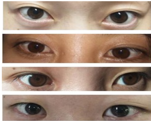
Figure 1. Sample images of iris

For data collection, we use smartphone as a stand-alone collection device. Using the rear and front cameras of the mobile phone to collect iris images in indoor and outdoor environments. Figure 1 shows a small sample iris. From this we can see that the iris collected by the smartphone has problems such as low image resolution, more noise factors and not obvious texture features.